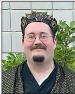
Saito Takauji (Uji)