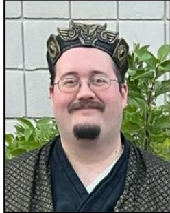
Saito Takauji (Uji)