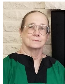
Exchequer Lady Lhiannan y Llysieuydd