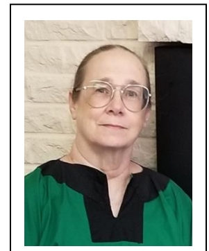
Exchequer Lady Lhiannan y Llysieuydd