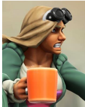
Seneschal Tofa in eldra Ericksdottir