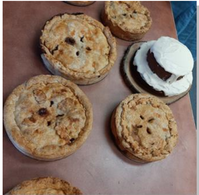
Several venison pies made by the feast steward (I didn't get her SCA name) and a tiered honey cake with buttercream frosting.

The afternoon court started promptly. One person new to the SCA was welcomed and given a new member token. Two AoAs were given; each recipient was given a golden 'A' token, a small knife, and an original scroll. Two Companions of the Cheval d'Or were granted for participation in equestrian activities. After closing of the Royal Court, we partook of a delicious feast made by the feast steward and Seneschal of Silver Keep consisting of stewed beef, venison pie, roasted carrots, mushrooms in sauce, focaccia bread with two different flavored butters, butternut squash soup, and honey cakes. Here ends my account, it was an enjoyable day for all and I have already written more than is my custom.