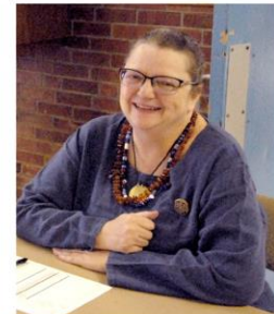
Cera helping at Gate